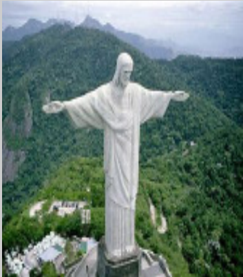
iconic sculpture of Jesus Christ in Brazil