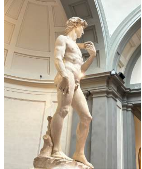
(David, Galleria dell' Accademia, Florence)