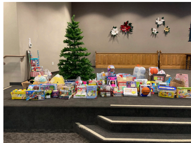
Catalyst family gifts